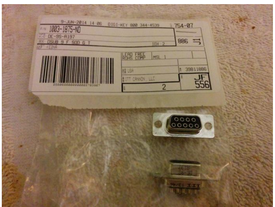
Page 2 of 7